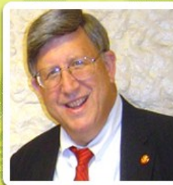
Jon Fox (Former Congressman)